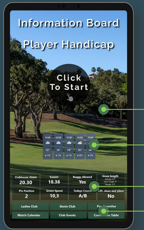
32-inch touch screen